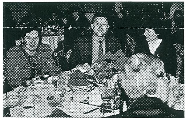
Northeast Florida Chapter of the Florida Engineering Society Christmas 2000